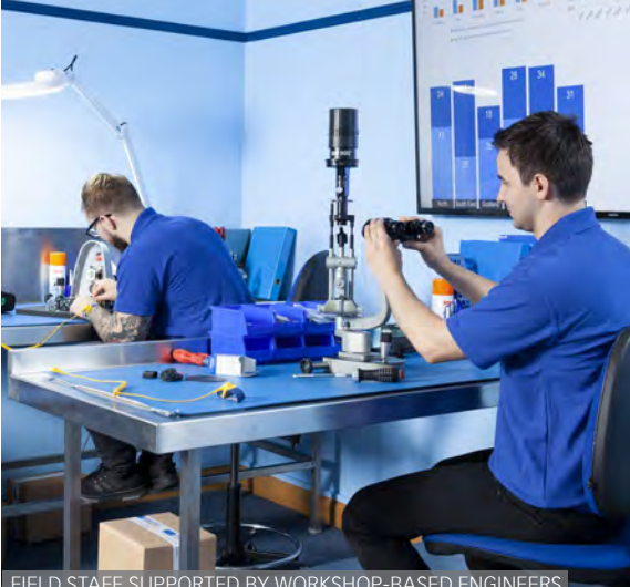
ORTED BY WORKSHOP-BASED ENGINEERS