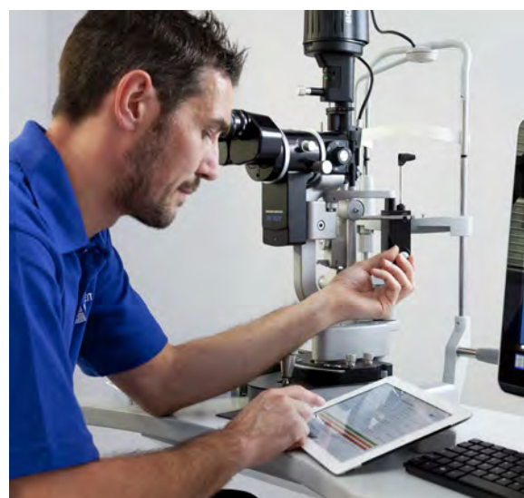
ALL CONTRACTS INCLUDE AN ANNUAL SITE

If you would like to discuss creating a bespoke contract for your hospital or clinic, please email our Service Team at service@haag-streit-uk.com and we will be happy to discuss the various options available.